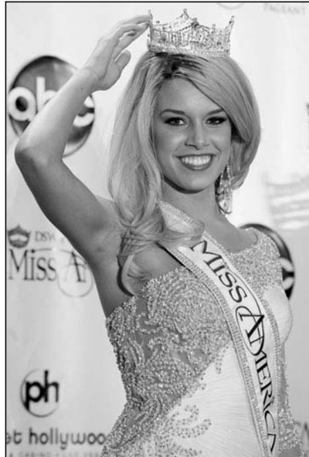
Miss America's Appearance is sponsored by:

Gering Memorial Chapel Platte Valley Companies U-Save Pharmacy Walmart Western Sugar