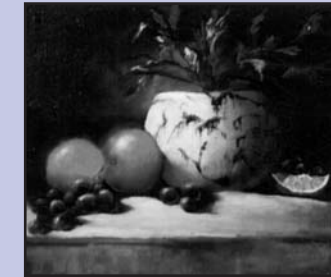
Artist: Leigh Morrison

Location: Tenth Street Contact: Chuck Cowan, 436-3304