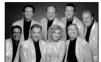
The Nacho Men